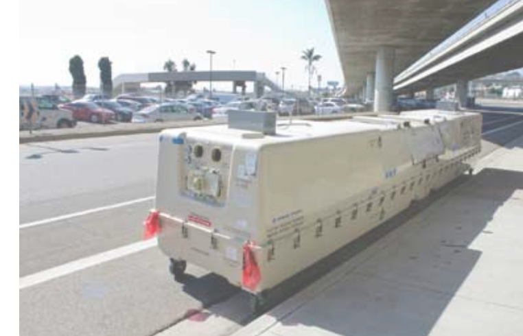
Composited from press releases from August 2011:

Drone Readymade: Fine Military Detritus Working as a public arts collective, participants and collaborators within TPP have initiated projects per opportunity. Drone Readymade is the first example of this process. Drone Readymade has become a perfor- mative saga, starting with the acquisition a decom- missioned logistical container for an MQ1 Predator drone, its eventual modification as a threadbare mobile living unit, and it's deployment throughout various sites con- stituting San Diego's military industrial complex.